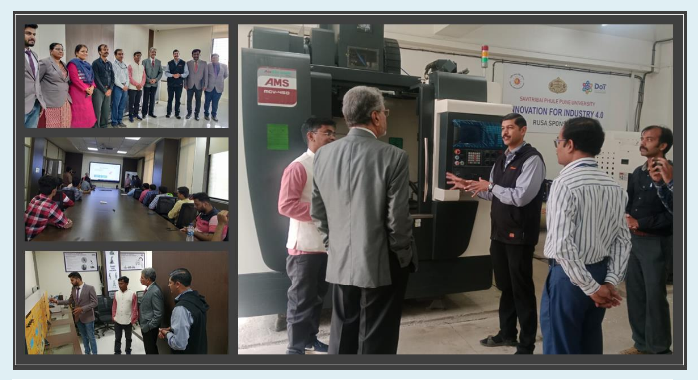
Various Activities conducted from January to June